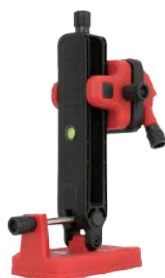
LM312 wall mount LM312 is suitable for LM573LD-II/575LD/576LD only.