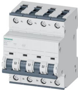
Miniature circuit breaker 400 V 10kA, 4-pole, C, 32 A, D=70 mm