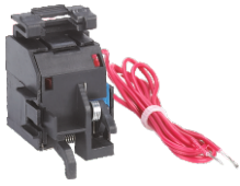
SHT-M2 shunt release